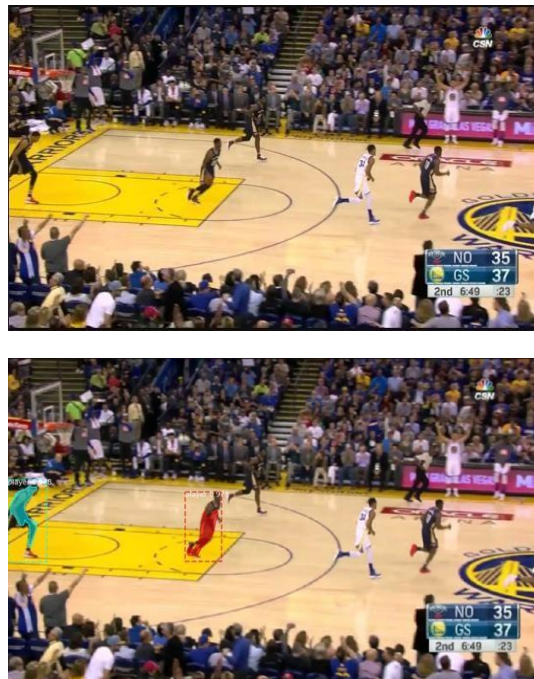
Fig. 3 Detection of Players in Paint Zone

The data used in this paper was edited about 30 frames of NBA game on November 7, 2016. In the process of creating a Ground Truth, it was classified into 2 classes, paint zone and player, and the Ground Truth was created so that the recognized player could be a player who has a bright paint zone. At this time, since the camera that shoots the actual game is several tens, only the players who are clearly in the paint zone are recognized based on the feet of the players from the angle of view shown in the video. For example, in the data below, one player is clearly in the paint zone but is not recognized because the player's feet are not visible and can be recognized by simply stepping on the paint zone line. However, the recognition of the players and paint zones is not nearly as perfect as the existing Mask R-CNN.