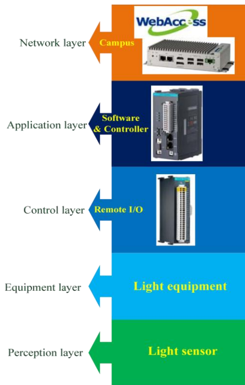
Fig. 1 The model of IoT

Based on the literature review, the structure of the IoT technique in this study based on WebAccess control system includes (1) perception layer, (2) equipment layer, (3) control layer, (4) application layer, and (5) network layer. Fig. 1 shows the model of the IoT.