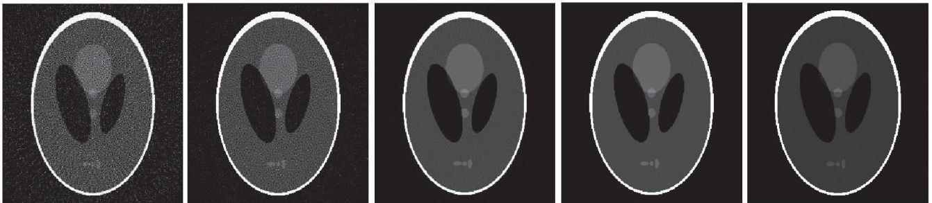
Fig. 2 Left to right: SheppLogan phantom reconstruction result using Wavelet, Curvelet, TV, CTV, and the proposed methods Fig. 3 Left to right: FORBILD head phantom reconstruction result using Wavelet, Curvelet, TV, CTV, and the proposed methods

We evaluate the method on two sets simulated data, i.e., SheppLogan phantom [25] and the head phantom which is built based on the work by FORBILD group [26] (Fig. 1). The data have the size of 256 \times 256 pixels and they are simulated with only 100 equally spaced projections. We