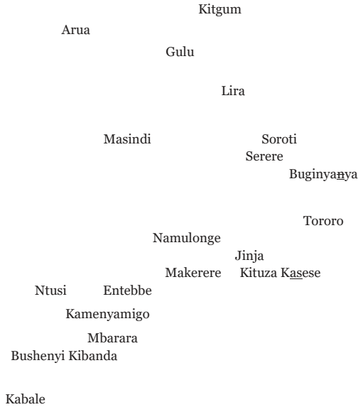
Fig. 1 Study region and contours in meters over the Uganda

Rainfall over Uganda exhibits large spatial and temporal variations with the first rains starting late in northern region. Generally Uganda experiences two rainy season