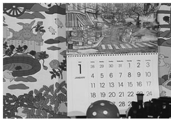
(a) Original (Mobile sequence, frame #1)

ME [4], whereas the EC-1BT based ME approach in [6] has the highest computational cost at this stage. When the matching stage computational complexity is assessed, the proposed approach has similar complexity with the W-C1BT based ME and it has considerably lower complexity than the method in [6]. It is clear that the multiplication operation for the suggested matching criterion could be implemented as a simple fetch from a look up table (LUT).