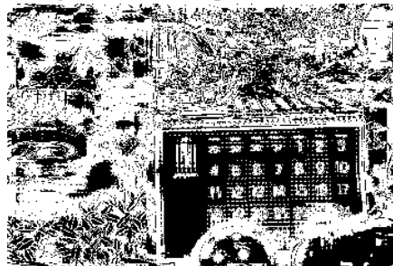
(b) C-1BT constraint mask (1-bit depth)