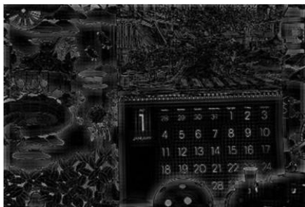
(d) Proposed approach constraint mask (8-bit depth)