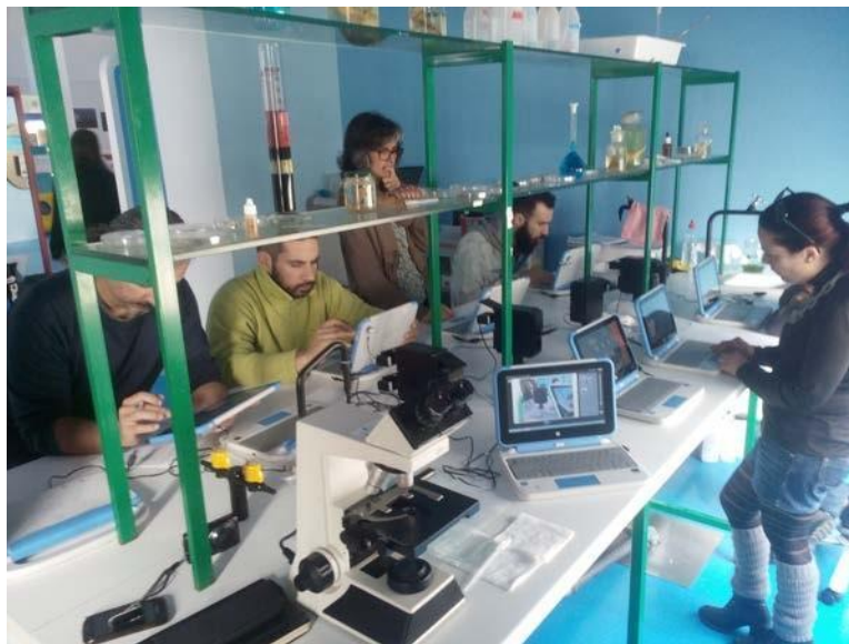
Figure 1. CCVAlg staff training session on software stack.

This work is an ongoing research and development. We intend to improve and diversify the activities that CCVAlg provides to the public. After the reception of the detachable keyboard tablets and the public announcement of the partnership on November 30 th of 2016, CCVAlg’s staff started to freely explore the devices. Then, after a short period, the more enthusiastic staff elements began to use the devices on activities that already were included in CCVAlg pedagogical offer. One month later, all the staff received one morning training provided by a team member capacitated in the use of the sensors and software stack present on those devices, as showed in Fig. 1.