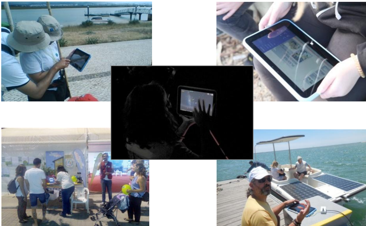
Figure 4. Pictures of some indoor activities in which the devices were used, namely activity 3.2.7 (top-left picture), activity 3.2.1 (top-right picture), activity 3.2.10 (bottom-left picture), activity 3.2.11 (bottom-right picture) and activity 3.2.8 (center picture). See text below for more information.