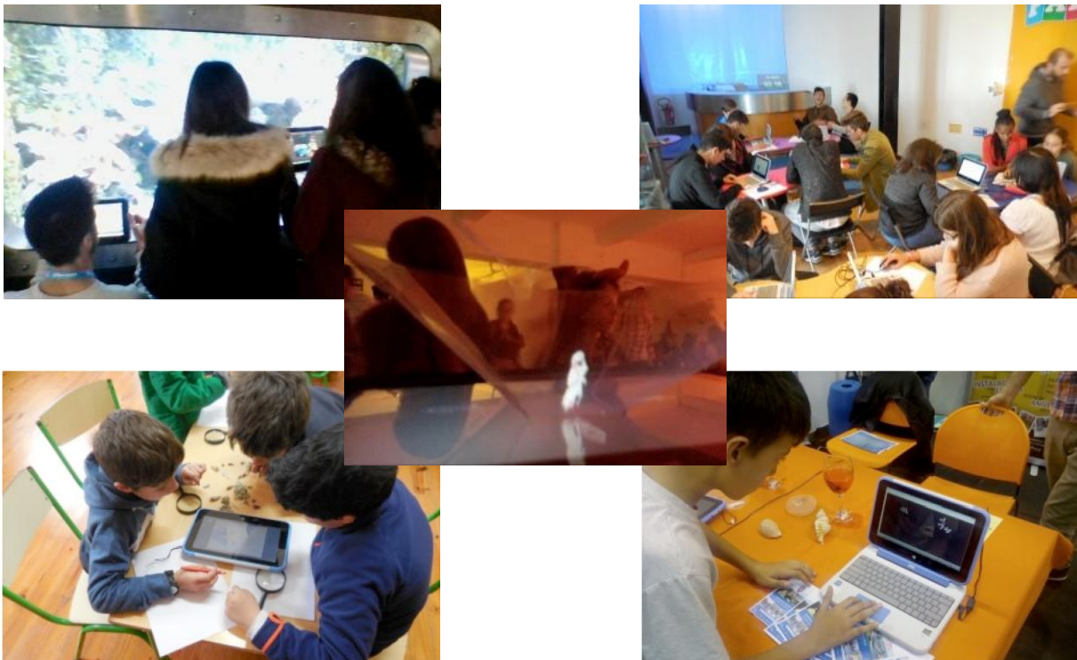
Figure 3. Pictures of some indoor activities in which the devices were used, namely activity 3.1.2 (top-left picture), activity 3.1.7 (top-right picture), activity 3.1.1 (bottom-left picture), activity 3.1.5 (bottom-right picture) and activity 3.1.6 (center picture). See text below for more information.