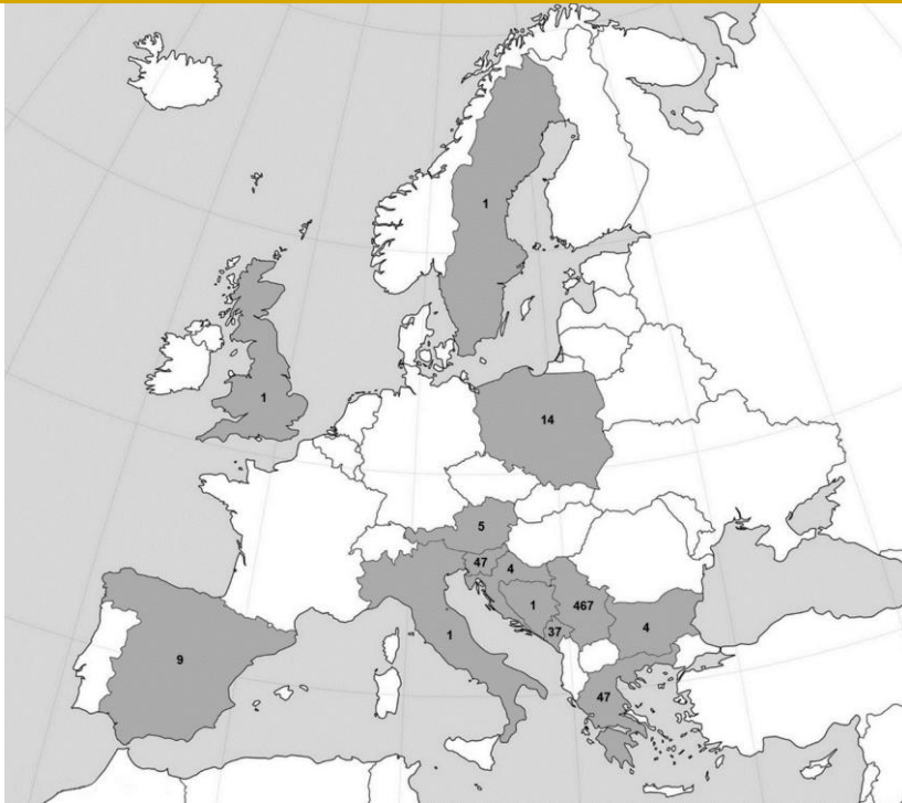
Figure 1. Number of samples collected per country.

Eighty-six lepidopteran species were not found on feeding plants but on the ground or on bark, such as Agrotis segetum (Denis & Schiffermüller, 1775), Thalpophila matura (Hufnagel, 1766), in beehives – Galleria mellonella (Linnaeus, 1758), as well as in stored products and grains – Plodia interpunctella (Hübner, 1813). The vast majority of caterpillars were found as mature larvae in their final (L5) instar. In some cases, for the same species, all larval instars (L1-L5) and even pupae, were found, e.g., Lymantria dispar (Linnaeus, 1758), Malacosoma neustria (Linnaeus, 1758), Saturnia pavoniella (Scopoli, 1763), Thaumetopoea pityocampa (Denis & Schiffermüller, 1775), or all four species from the genus Yponomeuta .