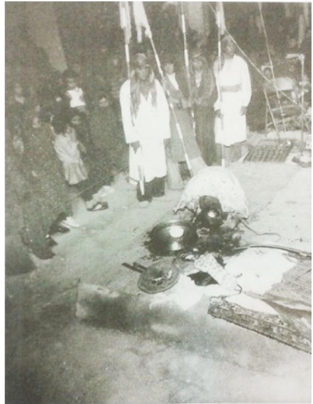
Fig. 1. Performer of Shemr and Amir-al Momenin besides each other watching the Taziye.

From the beginning but, this ritual art has had structural differences with classic theater and could not be classified in this category according to Aristotelian principles of theater. Taziye is an image, the description of the concept of Karbala and the text has been the last element adjoined it. The author of the texts of Taziye is unknown and if someone is named, it's the compiler or the editor. It seems these texts have been created and completed amongst the people, during the course of time. The performer is just a narrator who narrates the texts which he has not even memorized and simulates those people in Karbala. Chelkowski (2005: 13) maintains that reading the roles from the text may be an attempt to put a space between the performer and the role to prevent being exactly the person