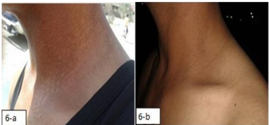
Figure (6) - a:- M. furfur lesion in untreated patient appear as white patches in neck and above sternum region . b: clearance of the lesion after treatment with ivermectin locally.

fluconazole therapy was found to be superior than other topical remedies like clotrimazole in the treatment of PV in terms of efficacy and patient compliance and also cost-effective for the patients 42 , but the efficacy depends on increasing of dose up to 300 mg weekly to be more potent, which is the main drawback due to possible toxicological effects 25,42 .