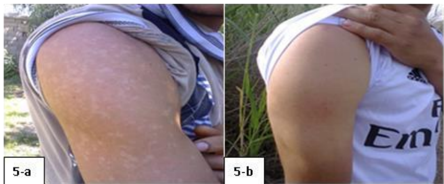
Figure (5): a:- M. furfur lesions in untreated patient appear as white patches in arm b: clearance of the lesion after treatment with C. craniiformis suspension locally.