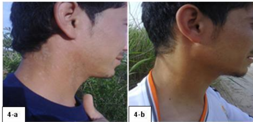
Figure (4): a:-lesions of M. furfur in untreated patient appear as white patches in cervico-fascial region . b:- clearance of the lesion after treatment with C. craniiformis suspension locally.

The oral fluconazole used in this study is a triazole antifungal agent acts by inhibiting cytochrome P450-dependent ergosterol synthesis in fungal cells in a similar manner of itraconazole and ketoconazole 25 . The efficacy of oral fluconazole reported in the present study comes closely to 41 , in which, the mycological cure using 150 mg fluconazole was reported