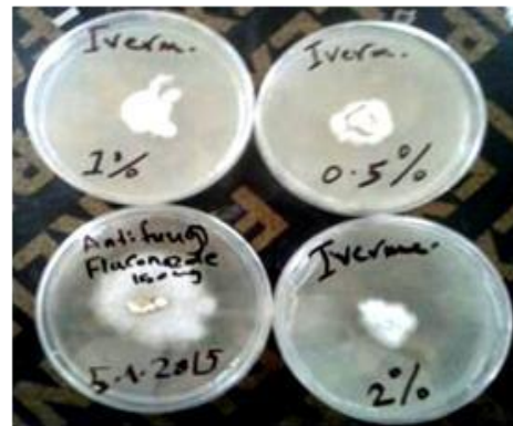
Figure 2: Effects of different concentrations of ivermectin aqueous solution on growth of M. furfur compared with fluconazole 150 mg (sabouraud Dextrose agar).