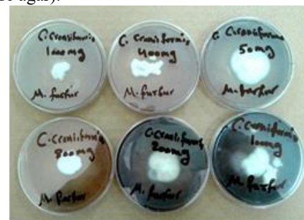
Figure 3: Effects of different concentrations of alcohol extract of C. craniiformis on growth of M. furfur (sabouraud Dextrose agar).

tion from animal sources as a result of direct handling of domestic dogs and birds which include the race pigeons. The main affected area in this study include neck and shoulder, less frequently the trunk and this may attributed to several factors includes but not limited to, humidity and high temperature, hyperhidrosis, familial susceptibility, and immunosuppression 25 . A range of skin microenvironmental factors, such as the bacterial microbiota present, pH, salts, immune responses, cutaneous biochemistry, and physiology, may play a role in adherence and growth of malassezia species , favouring distinct genotypes depending on the geographical area and/or the skin sites 26 , which come in conflicts with others, reported that the trunk represent the main affected sites 20 . The medications used in this study when compared with other studies using other remedies, are cheap, available, easily intake and safe. The medications previously used in treatment of PV include azole compounds 27 . The present study disclosed that alcoholic extract of C. craniiformis (1000 mg) was effective in 90% of PV cases, which respond to treatment and the meantime for clearance was 24days. Aqueous solution of ivermectin (2 %) was effective in (75%) of PV with meantime for clearance was 23.5 days. In control group, (70%) patients respond to treatment with fluconazole (150mg), and the meantime for clearance was 41days.